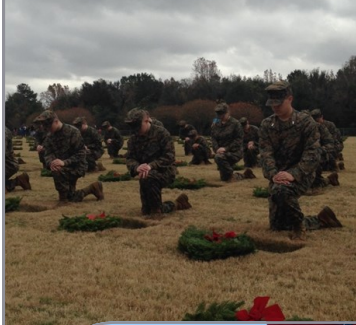
Wreaths Across America Region Five, Atascocita HS