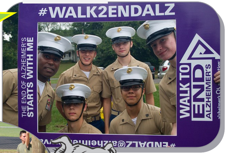
Region One, Culpeper HS