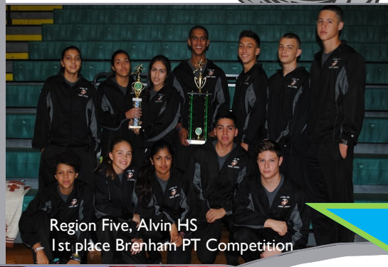
Region Five, Alvin HS 1st place Brenham PT Competition